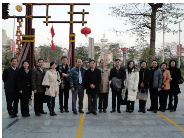
Delegates visited the Guangdong Party School on 21 January 2011