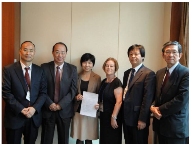
Presidents of public administration societies in Asia Signing MOU