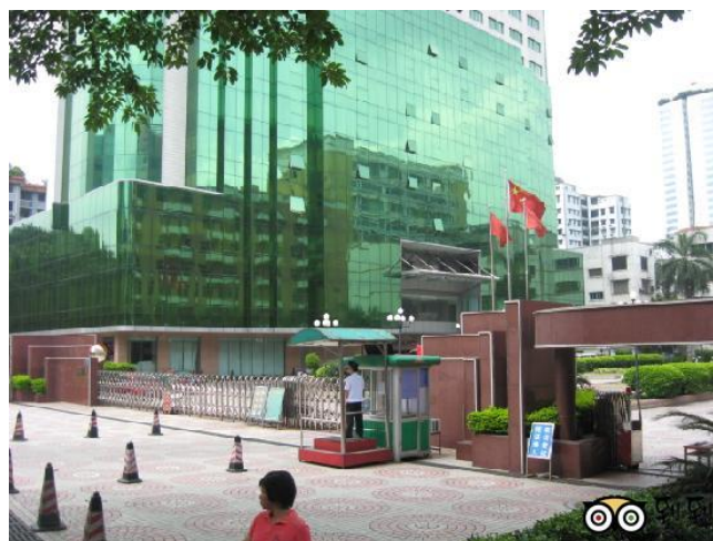
The Guangdong Party School

13 participants from various organizations from Hong Kong joining the workshop. At the meeting, the Party School proposed a study visit course on the 100 th anniversary of Xinhai Revolution for Hong Kong people. HKPAA is interested and will try to organize its members to join. After the meeting, a visit was arranged to see the Pearl River Beer plant and its museum, a very successful large State Owned Enterprise. After the dinner, the group went to see a circus show at the Changlun resort area. The show was spectacular. On the second day, a tour was arranged to the Guangzhou university town and the Guangdong Sciences Museum where an Albert Einstein exhibition was held. These visits are very educational and enjoyable.